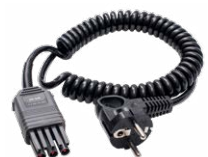
WS-04 adapter with UNI-SCHUKO angular plug WAADAWS04