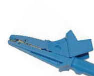
blue "crocodile" clip 1 kV 20 A WAKROBU20K02