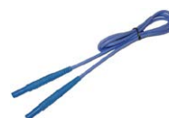
test lead with banana plugs; 1 kV; 1.2 m; blue WAPRZ1X2BUBB