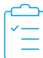
Calibration certificate with accreditation