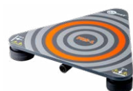
PRS-1 resistance test probe WASONPRS1