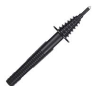
test probe with banana socket; 1 kV; black WASONBLOGB1