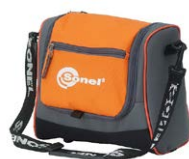
M-6 carrying case WAFUTM6