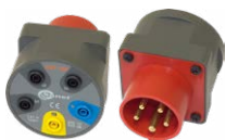
AGT-16P three- phase socket adapter 16 A WAADAAGT16P