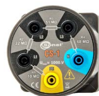
CS-1 cable simulator WAADACS1