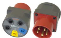
AGT-32P three- phase socket adapter 32 A WAADAAGT32P