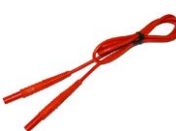
test lead with banana plugs; 1 kV; 1.2 m; red WAPRZ1X2REBB