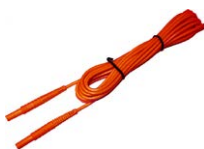
test lead 5 m, red, 1 kV (banana plugs) WAPRZ005REBB