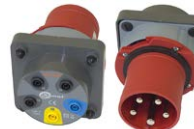
AGT-63P three- phase socket adapter 63 A WAADAAGT63P